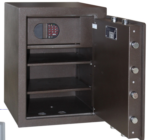
CLE I.55 T